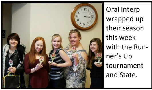
Oral Interp wrapped up their season this week with the Runner's Up tournament and State.